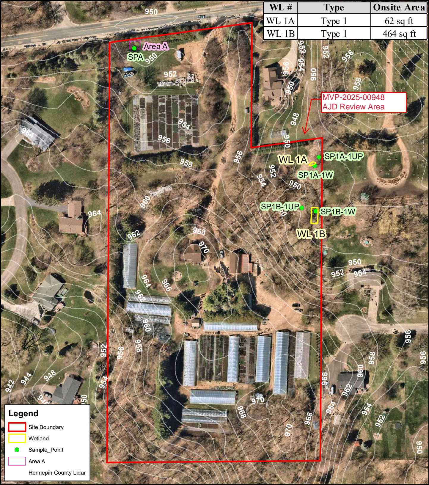
Figure 2 - Existing Conditions