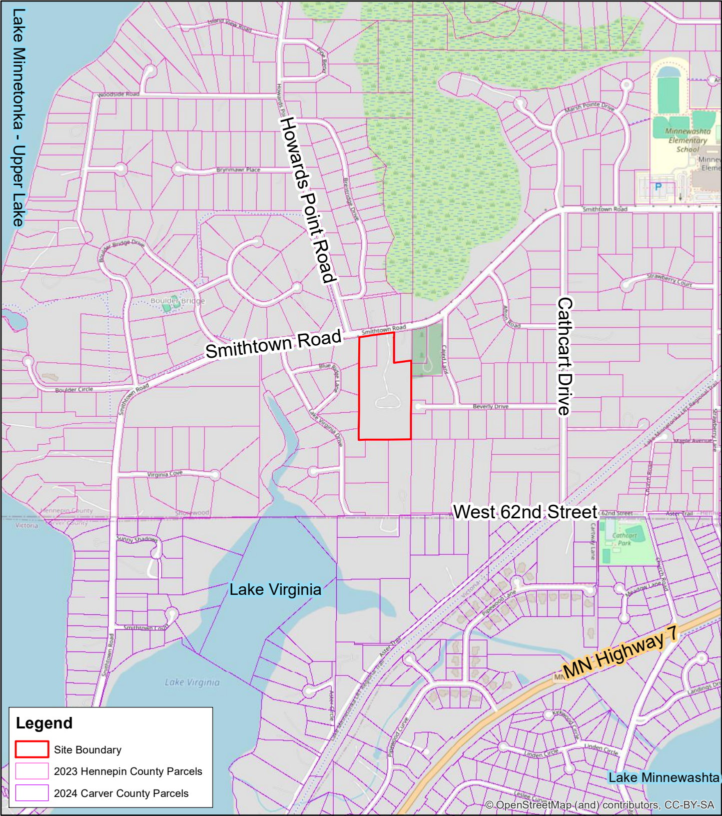
Figure 1 - Site Location